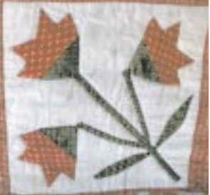
A square from the Delaware Valley quilt at left, 1840's