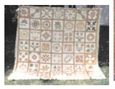
Delaware Valley quilt. Signed and dated, 1840's