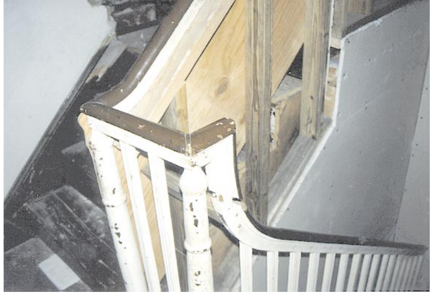
Details of the original Federal balusters, newels, and railing located in the rear of the building between the second and third floors. Kathi noted that only finer homes of the period had staircases of such elegance.

removed along the interior wall of the staircase as evidenced by a change from hand-split lath to circular sawn (seen in an area where the plaster was broken through). The balance of the attic is finished in the style of the late-19th century, albeit damage from a fire and modifications to install modern HVAC systems. The ad from 1879 [October 28, 1879 Doylestown Democrat ] lists 15 rooms total (as opposed to 12 in 1836), helping to verify this Victorian remodeling.