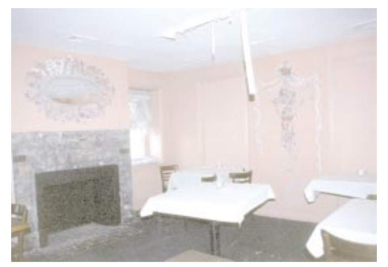
"Pink room", located on the second floor of the main building. Fireplace mantel has been carefully removed, revealing the stone support system. Residents recall beautiful punch and gouge mantels on the fireplaces when the Spread was still open for business.

There is mention in the 1836 and later advertisements of two wells of water, icehouse and milk vault, barns and stables. The only feature of these structures to remain apparent today is one well, with an above ground "wishing well" appearance, that is located outside the south end of the building, not far from the cellar entrance.