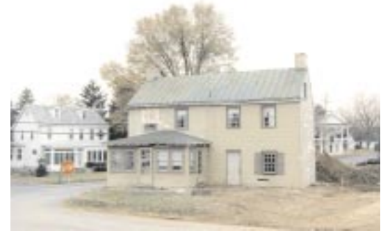
The property at Upper Holland and Bustleton before it was recently torn down to make way for an office complex.