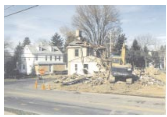
Tearing it down. The Victorian house in the background was also torn down as shown below.