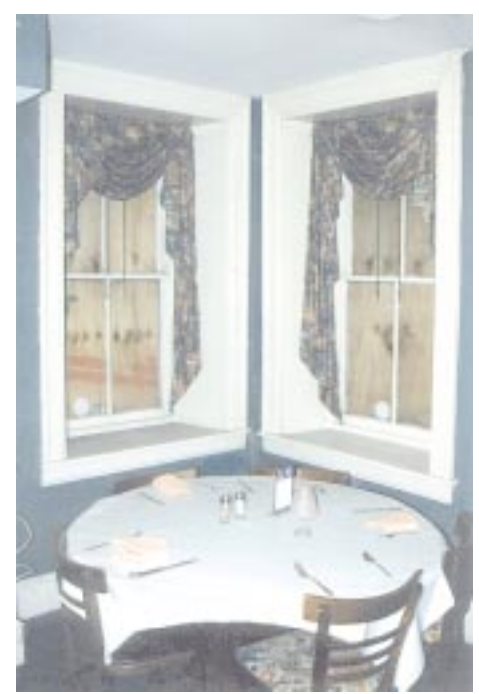
The Tables are still set for dinner! View showing the woodwork details of the Northeast windows of the first floor.

The present roofline is also from the last quarter of the 19th century, of Mansard design with four dormers on the front, east slope and two on the south and north and three on the west. The original roof design is conjectured to be gable in the prevailing style, although no firm architectural evidence has yet been uncovered to verify this. The original attic was finished as described in the 1836 advertisement with "four rooms and an entry" on the "3rd floor" . The staircase to the attic is of the original Federal design with portions of the railing and decorative fretwork below the treads intact. The original stone walls of the hotel continued approximately one foot above the attic floor. These are hidden behind false walls built to give the Victorian attic rooms vertically plumb exterior walls. In the staircase area behind this false wall (against the rear west wall) is the original chairrail. This chairrail was