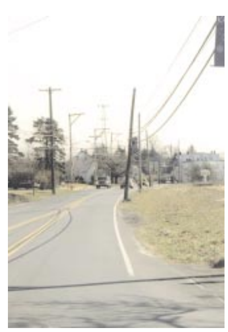
View looking east on Almshouse Road entering Richboro. Visitors are greeted with the site of an ugly tower.

Is it just me or is there really something wrong here? Your comments are welcome.