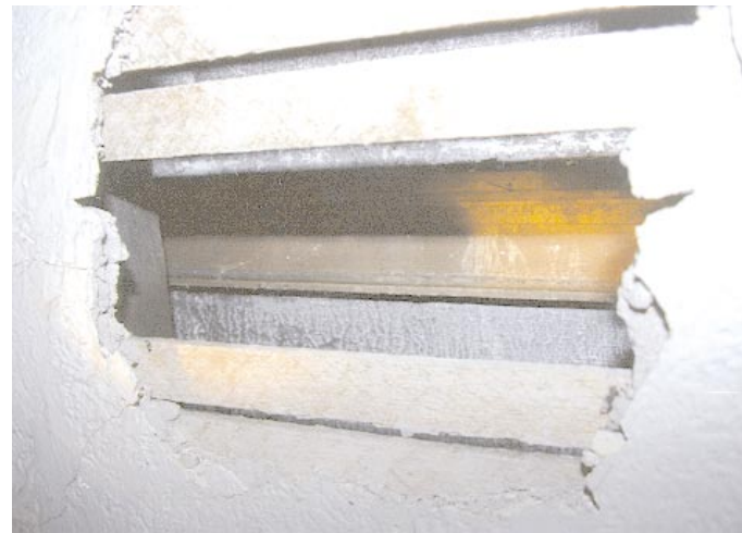
Kathi Auerbach discovered the original Federal chairrail behind a false wall in the rear stairwell. (Right) In this photo Kathi noticed two different kinds of lath; hand-split and circular sawn, indicating a later patching when

While the building dates to 1810, the roof, rear two-story addition and other modifications date from the late-19th century and have been a part of the hotel's operations for over one hundred years. Consideration should be given to restoration primarily to this period with preservation and inclusion of the original Federal features wherever possible, including the mantles and, if possible, the staircase.