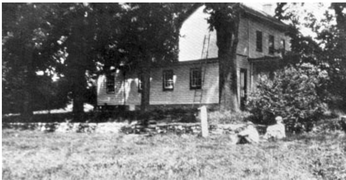
The Twining house where Miss Sally was born.. Located on Twiningford Road in Tyler State Park.